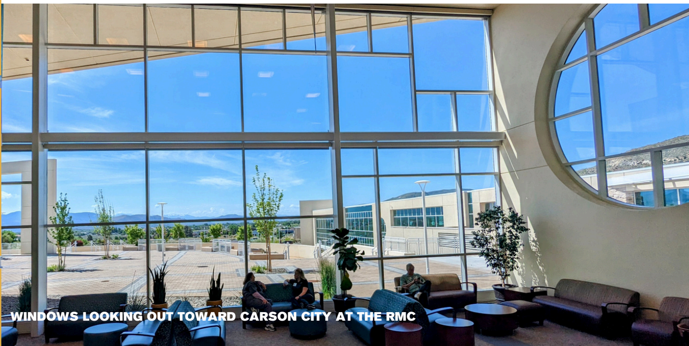
WINDOWS LOOKING OUT TOWARD CARSON CITY AT THE RMC

HEALTH FAIRS AND COMMUNITY EVENTS WITH INCREASING INVOLVEMENT AND COMMUNITY SUPPORT